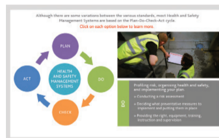
Introduction to Health & Safety Audits