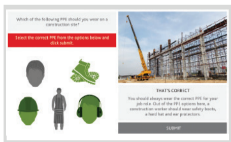
Personal Protective Equipment (PPE)