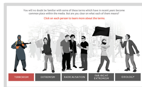
Preventing Radicalisation & Extremism in Education