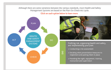
Introduction to Health & Safety Audits